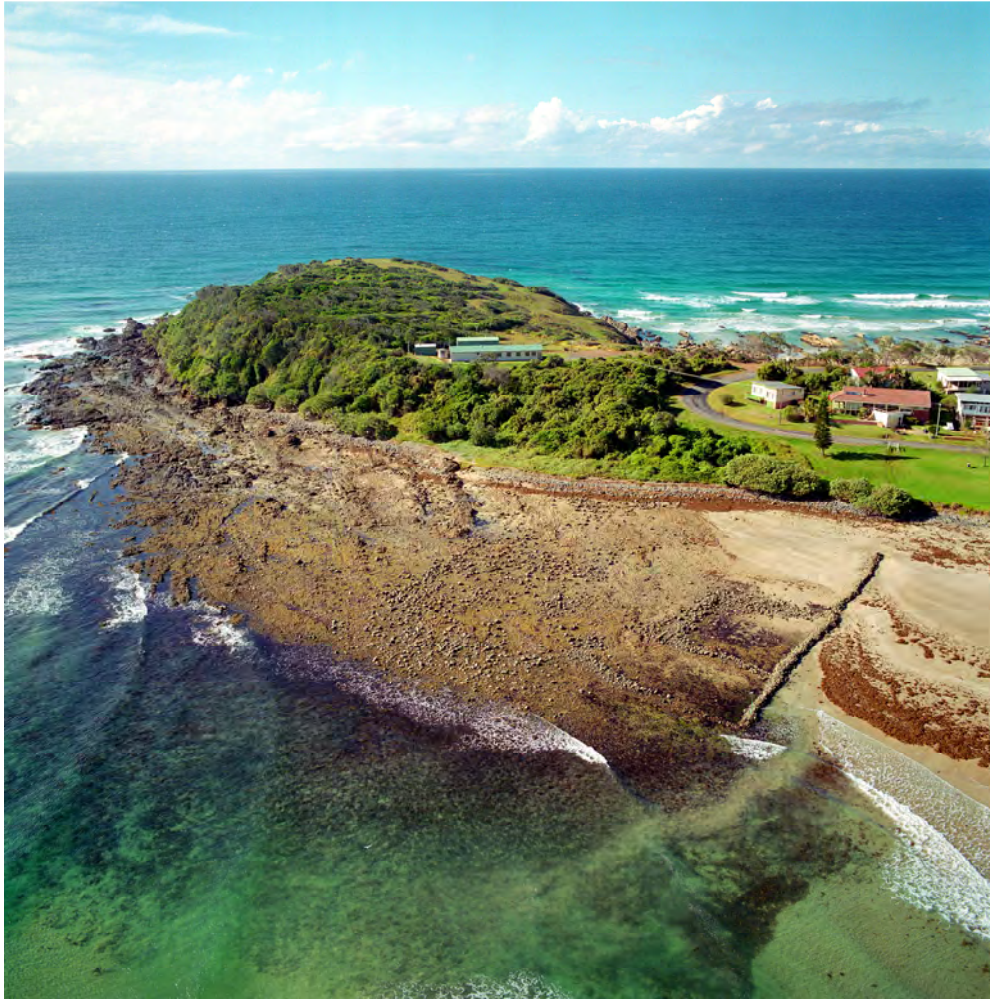
Figure 2. Aerial view of Arrawarra Headland, stone fish traps (right) and UNE research station (top).