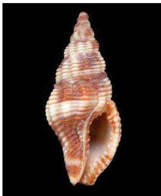
Engina australis , typical specimen from NSW

Very recently, when sorting shell sand collected in 2005 from the beach at Semaphore, near Adelaide, South Australia, I picked out a half-grown 7 mm long specimen of E. australis . Though a little beach rolled, and with a large bore-hole in the body whorl, it is typical in shape, sculpture and colour to NSW shells. Is this an indication that E. australis occurs in South Australian waters, or that it may have done so, perhaps briefly, in the not too distant past? The specimen has been deposited in the Museum Victoria mollusc collection.