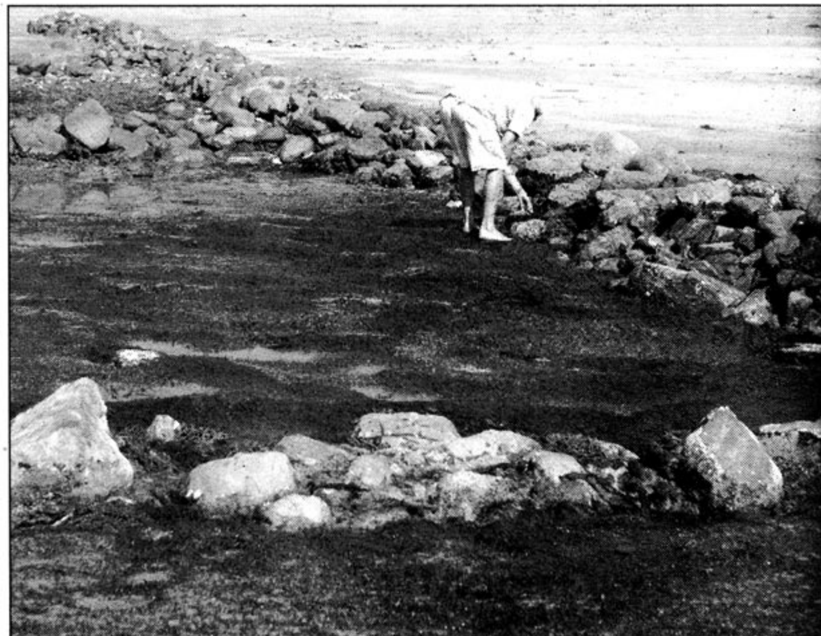
The Aboriginal fish traps at Arrawarra Headland.